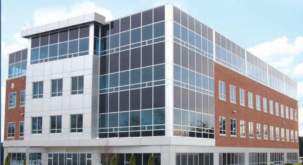
SECTION A / PAGE 12