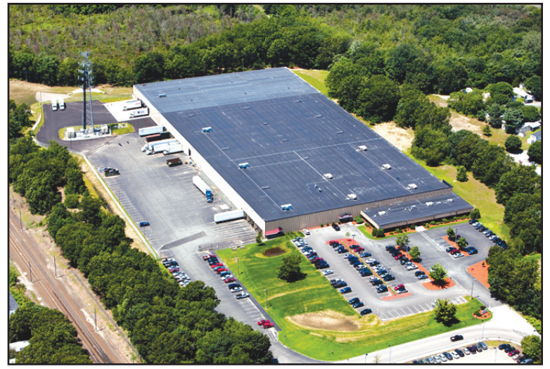
Aerial view of 505 Collins St., Attleboro, Mass.

The original 152,730 s/f building was built in 1979 and recently underwent a 50,000 s/f state of the art expansion. The building features 18 loading docks, 2 drive-in doors and 18 foot clear ceiling heights making