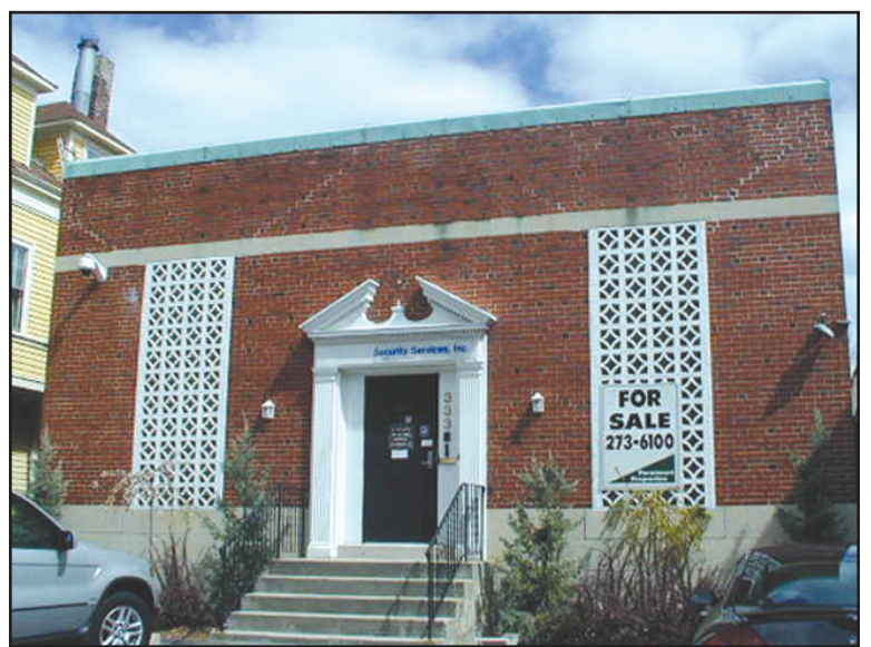
33 Smith St., Providence, Mass.